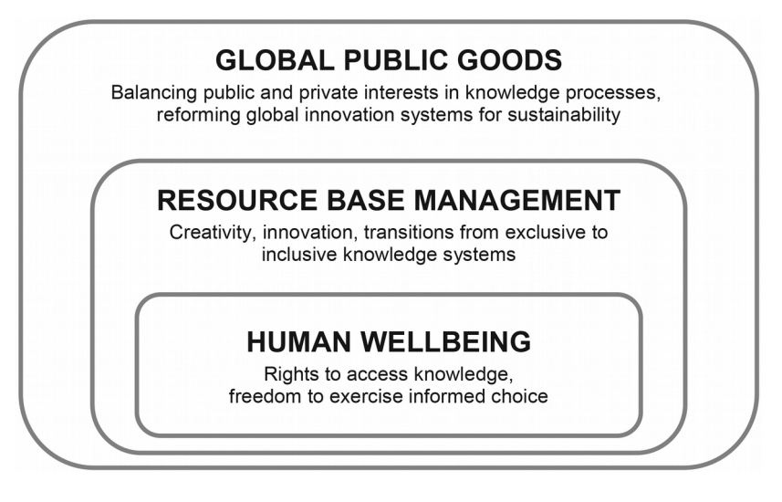
Figure 2. Knowledge governance for sustainable development—a framework for future research.

Analysing the findings of the review in relation to the layer cake framework demonstrates not only that knowledge governance is relevant to sustainable development, but also that it relates across the three scales of Nilsson et al.'s [1] model. From individual wellbeing and rights to organisational and institutional structures, through to global scale innovation systems, the knowledge governance literature presents a multiscalar suite of issues. It helps to explain the 'persistence' of science-policy gaps [9], as efforts to overcome these gaps at project or organisational scales come into contact with broader social, cultural and legal systems that favour exclusion and private gain over inclusion and collaboration. This framework offers guidance to further examine this broader context of knowledge governance in relation to sustainability.